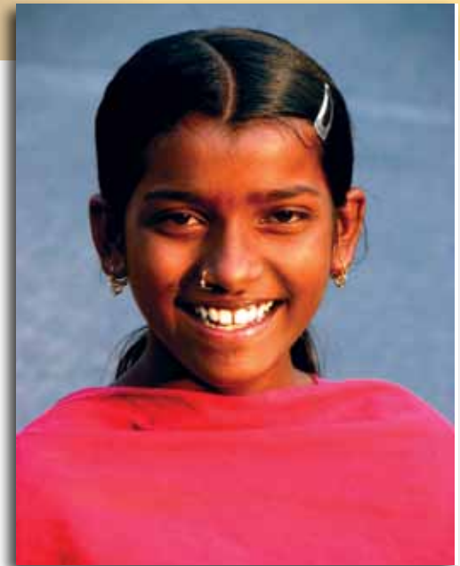
Most children participating in the prevention programs had less anxiety when programs ended than comparison children.

Fisak and colleagues did more than identify whether programs produced statistically significant effects. They also examined the magnitude of these effects — or the effect size (ES) of each program. Effect size (typically measured using “Cohen’s d ”) identifies whether an intervention makes a clinically meaningful difference in children’s lives. Although interpretation